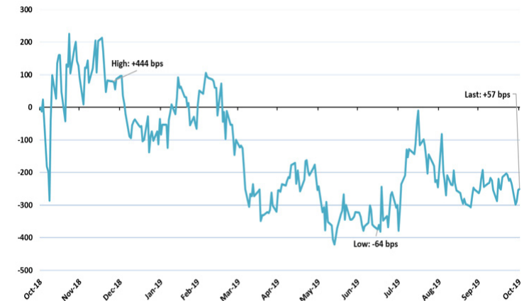
Exhibit 5. MXE Spread Performance Comparison vs. MEXBOL Index. One Year through October 31, 2019.

Past performance is not a guarantee of future results.